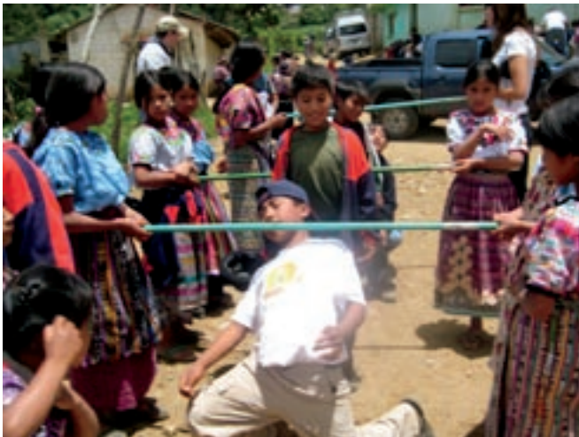
The Vale team organized activities for the children — making paper airplanes, a sack race, jump rope, and doing “the limbo,” a dance in which the dancers bend over backwards and pass repeatedly under a pole.