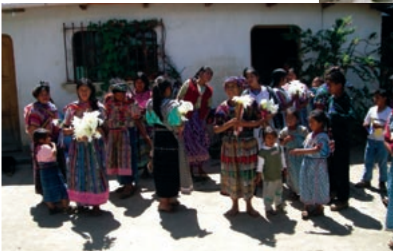
Before the Vale team departed, the women who had received stoves prepared a meal for them and presented them with flowers wrapped in fabric that they had woven.

“I had felt we couldn’t make a difference with so few people ... I was wrong ... we did !!!”