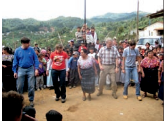
On the final day of the trip, the Mayans held a special celebration that also became a fund-raising event. Several of the Virginia volunteers enjoyed learning a new dance.

“For the fund-raising event, they had several ‘rooms’ for which we paid admission. One showed native costumes which we were allowed to try on for $1.00; one had the children presenting folk dances; one had children’s artwork (some for sale); and one had woven products that we could purchase.”