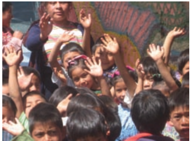
“It was difficult driving away from the village for the last time as all the children crowded around the bus waving good-bye.”

“We visited the classrooms, had our faces painted, tried on the Mayan clothing, had photos taken, and bought some of the items the women had woven. They made several hundred dollars, and the day was a big success. It was very evident with all the bright smiles; they were pleased with their efforts.”