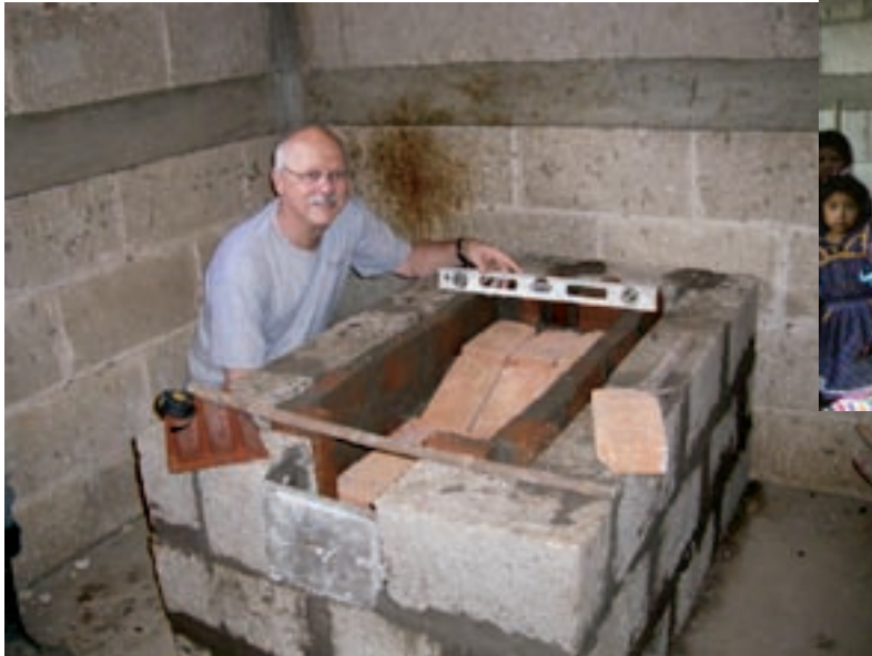
A volunteer is building a stove that will be ventilated to reduce the smoke inside a house.

“It was heartwarming to see the excitement and hear all the laughter among the women deciding where to position their new stove.”