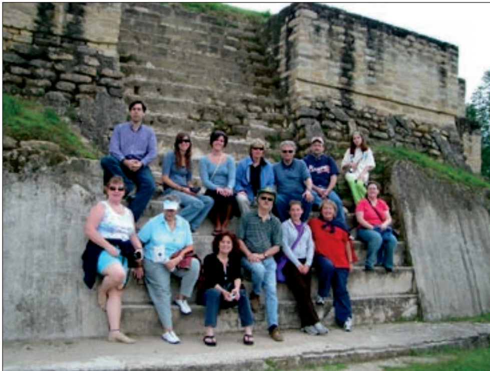
This group from Oakton, Virginia, spent a week working in the highlands of Guatemala to help Mayan villagers improve their lives.